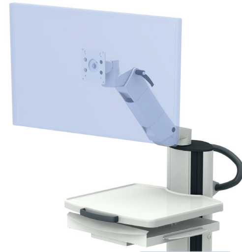
VESA 75 / 100 adjustable

Variable height support arms – high range of movement and ergonomic positioning